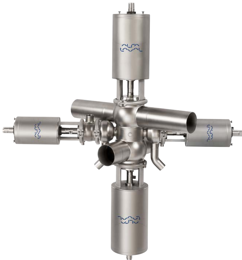
Figure 1. The Alfa Laval Aseptic Mixproof Valve.

Modularity makes it easy to configure the Alfa Laval Aseptic Mixproof Valve for use in any sterile processing application. It also gives manufacturers with greater flexibility to meet changing requirements. Choose a standard valve body and a tangential valve body or use two standard valve body types. It is also easy to mount in either a horizontal or vertical position. There are one- and two-step actuators, three seat-lift versions, five steam valve types and a range of options for steam temperature monitoring.