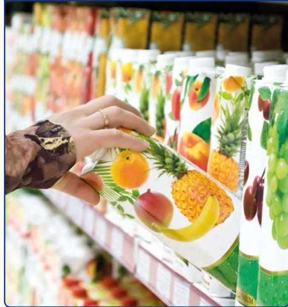
Figure 3. Demand for aseptically processed products is on the rise.

it easy for manufacturers to capitalize on the strong and steady growth in the aseptic processing. To help manufacturers stay competitive, the Alfa Laval Aseptic Mixproof Valve features: